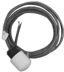
Part # 1302033

Provides outdoor temperature information to Steffes 2100, 2000 and/or 1000 series room units as well as Comfort Plus central systems for automatically regulating brick core temperature.