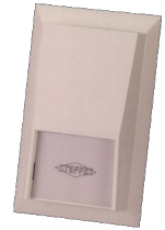
Part # 1302024 (1-heater) 1302041 (2-heater) 1302042 (3-heater)