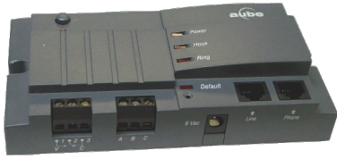
Part # 1302034

Provides room temperature set back signals to Steffes 2100, 2000 and/or 1000 series room units through telephone communication.